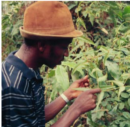
Looking for new species and medicines

Could your church hold a fund raising event? ----- to save habitat or species -----