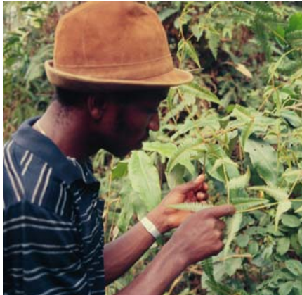
Research looking for new species and medicines

Could your church hold a fund raising event? ----- to save habitat or species -----