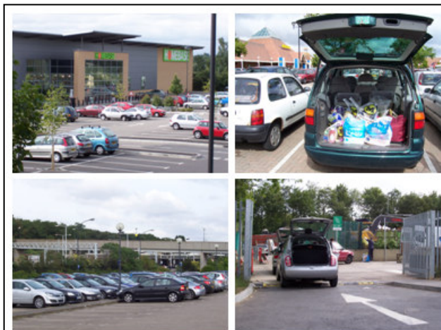
The private motorcar of today... and tomorrow?